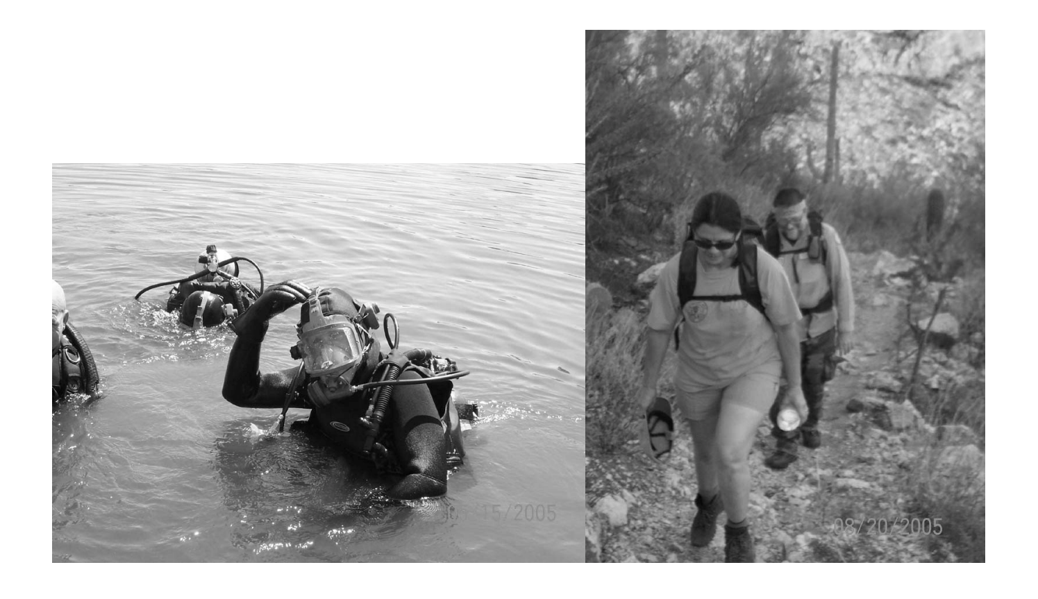
SARCI in Action