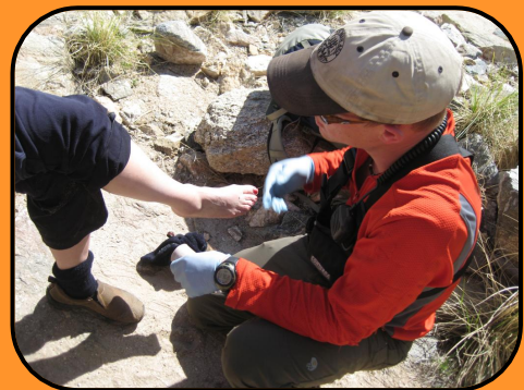
A SARA member performs an assessment on an ankle injury.

While assessing your patient one of the most important things you can do is talk to him or her. One thing most new people struggle with is asking patient assessment questions while performing a hands on assessment. A great way to practice your assessment routine is to practice regularly on a pet, while the anatomy is different, it will help you get used to asking certain questions and develop your routine.