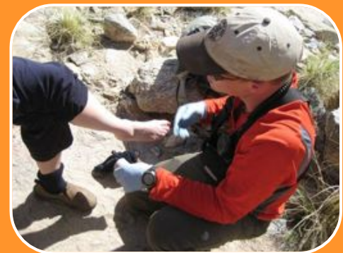
A SARA member performs an assessment on an ankle injury.

Having a patient ride out on a mule can greatly expedite a rescue. Some factors that prevent your patient from a mule ride: altered LOC, nausea or vomiting, lightheaded, or spinal compromise. Also remember that bulky leg splints will make riding out on a horse difficult. If your injury can be splinted multiple ways, choose the least bulky.