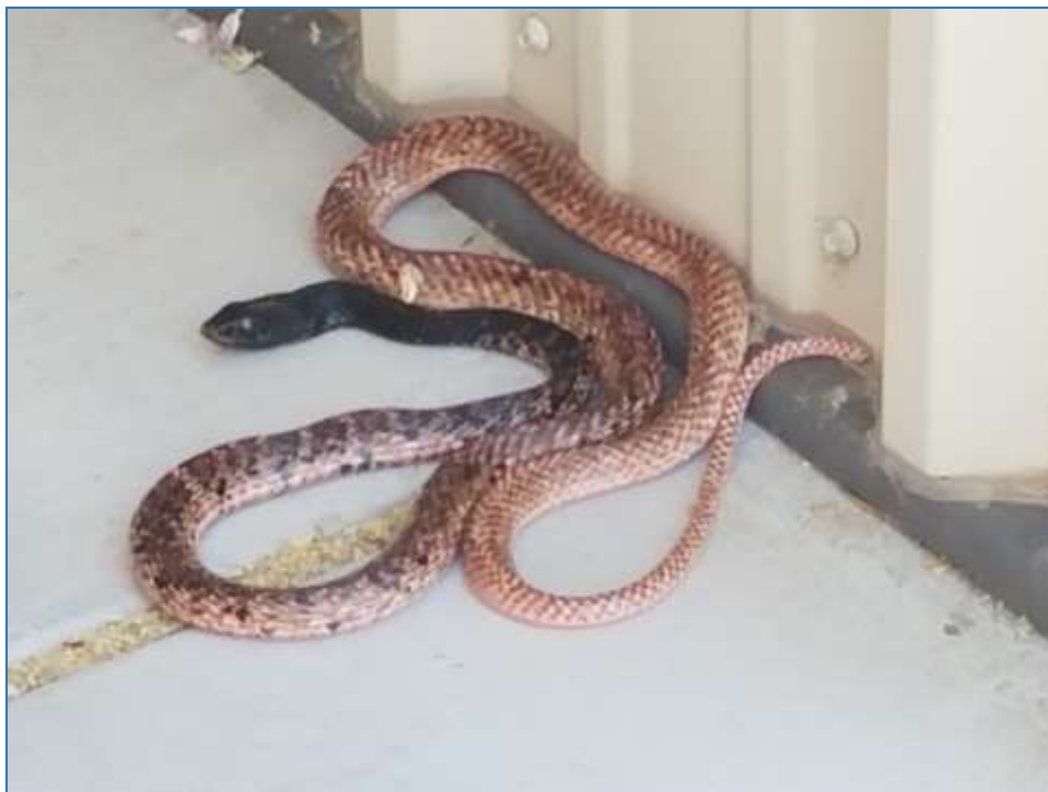
SARA House visitor – chillin’ on the concrete on a warm day

The Ski Patrol Magazine, Summer Catalog, and the OEC Refresher Workbook will be mailed the first week of May.